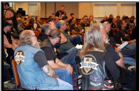
The Christian Unity Workshops are well attended by both Christian and Secular motorcycle groups.