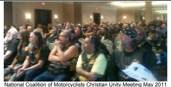
National Coalition of Motorcyclists Christian Unity Meeting May 2011

Church to do relief work. The biker pastor welcomed us with open arms. He was one of the first with the ability to arrive to the scene of the destroyed towers because his Harley was able to maneuver through the debris. We spent a week visiting Fire Departments, carrying supplies to the weary and just standing on street corners around the perimeter of the devastated area, comforting, praying and offering whatever relief we could supply.