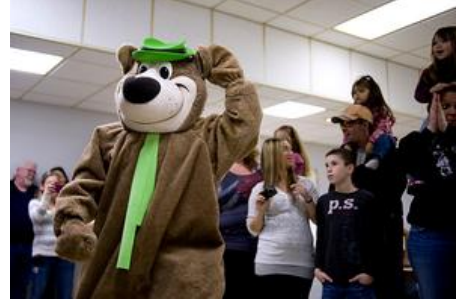
Yogi Bear makes an

year, but now she's getting old enough to appreciate it. "Those precious years are just beginning," she said.